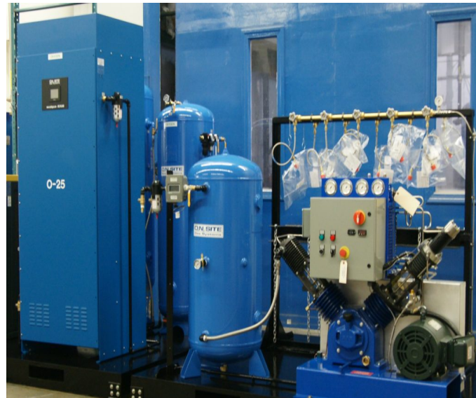
Oxygen Generator & Cylinder Filling