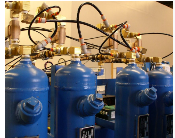
Oxygen Generator & Cylinder Filling